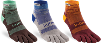
Mint Neptune Solar