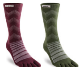
New Garnet New Forest