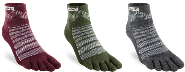
Garnet Forest Slate

STYLE: 223630 CUSHION: Padded Cushioning HEIGHT: Mini-Crew SIZES: S, M, L, XL FIBER CONTENT: 71% Merino Wool 26% Nylon 3% Lycra®