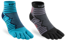
Pacific Blue Onyx