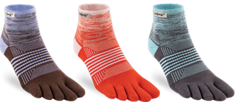
Periwinkle Hibiscus Seascape