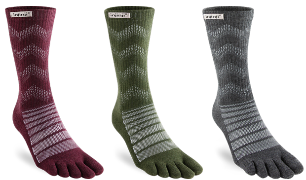
Garnet Forest Slate

STYLE: 223630 CUSHION: Padded Cushioning HEIGHT: Mini-Crew SIZES: S, M, L, XL FIBER CONTENT: 71% Merino Wool 26% Nylon 3% Lycra®