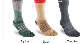
Alpine Spur Granite