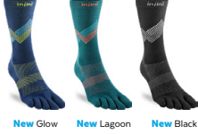
New Glow New Lagoon New Black