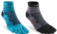
Pacific Blue Onyx