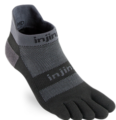
Black / Gray

STYLE: 203110 CUSHION: Padded Cushioning HEIGHT: No-Show SIZES: S, M, L, XL FIBER CONTENT: 67% Nylon 30% COOLMAX® EcoMade 3% Lycra®