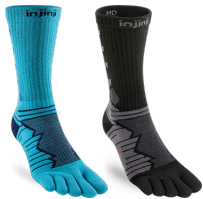
Pacific Blue Obsidian