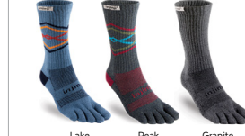
Lake Peak Granite