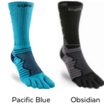
Pacific Blue Obsidian