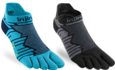
Pacific Blue Onyx