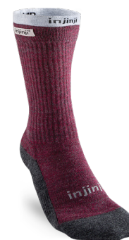
Maroon + Gray