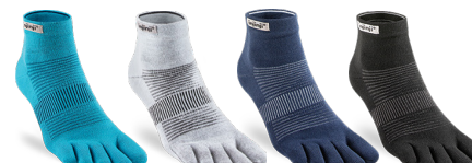
Pacific Blue Gray Navy Black

STYLE: 281130 CUSHION: Ultra-Thin Cushioning HEIGHT: Mini-Crew SIZES: S, M, L, XL (XL excludes Pacific Blue) FIBER CONTENT: 62% Nylon 35% COOLMAX® EcoMade 3% Lycra®