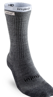
Charcoal + Gray