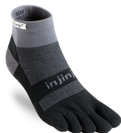
Black / Gray

STYLE: 203230 CUSHION: Padded Cushioning HEIGHT: Mini-Crew SIZES: S, M, L, XL FIBER CONTENT: 67% Nylon 30% COOLMAX® EcoMade 3% Lycra®