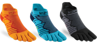
Desert Orange Pacific Blue Onyx

STYLE: 401110 CUSHION: Midweight w/Padded Toes HEIGHT: No-Show SIZES: S, M, L, XL (Onyx, Pacific Blue) FIBER CONTENT: 64% Nylon 33% COOLMAX® EcoMade 3% Lycra®