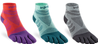
Razzmatazz Glacier Slate

STYLE: 401131 CUSHION: Midweight w/Padded Toes HEIGHT: Mini-Crew SIZES: XS/SM, MD/LG FIBER CONTENT: 64% Nylon 33% COOLMAX® EcoMade 3% Lycra®