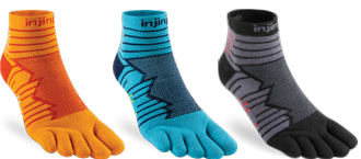
Desert Orange Pacific Blue Onyx

STYLE: 401130 CUSHION: Midweight w/Padded Toes HEIGHT: Mini-Crew SIZES: S, M, L, XL (Onyx, Pacific Blue) FIBER CONTENT: 64% Nylon 33% COOLMAX® EcoMade 3% Lycra®