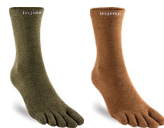
New Pine New Elk