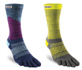
New Twilight New Lightning