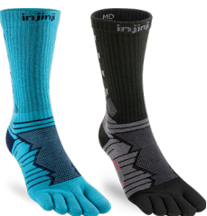
Pacific Blue Obsidian

STYLE: 401170 CUSHION: Midweight w/Padded Toes HEIGHT: Crew SIZES: S, M, L, XL FIBER CONTENT: 67% Nylon 28% COOLMAX® EcoMade 5% Lycra®