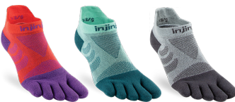
Razzmatazz Glacier Slate

STYLE: 401111 CUSHION: Midweight w/Padded Toes HEIGHT: No-Show SIZES: XS/SM, MD/LG FIBER CONTENT: 64% Nylon 33% COOLMAX® EcoMade 3% Lycra®