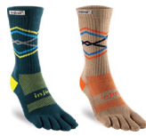
New Eclipse New Grain