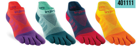
Razzmatazz Glacier Berry Sunflower