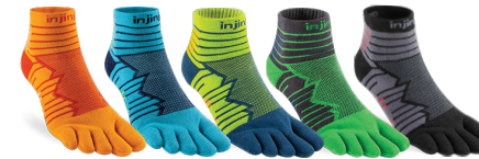
Desert Orange Pacific Blue Moss Emerald Onyx

STYLE: 401130 CUSHION: Midweight w/Padded Toes HEIGHT: Mini-Crew SIZES: S, M, L, XL (Onyx, Pacific Blue) FIBER CONTENT: 64% Nylon 33% COOLMAX® EcoMade 3% Lycra®