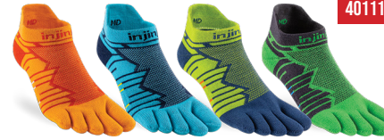
Desert Orange Pacific Blue Moss Emerald