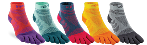
Razzmatazz Glacier Berry Sunflower Slate

STYLE: 401131 CUSHION: Midweight w/Padded Toes HEIGHT: Mini-Crew SIZES: XS/SM, MD/LG FIBER CONTENT: 64% Nylon 33% COOLMAX® EcoMade 3% Lycra®