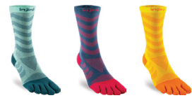
New Glacier New Berry New Sunflower