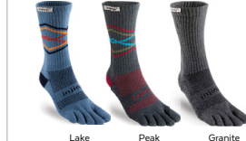
Lake Peak Granite