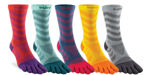
Razzmatazz Glacier Berry Sunflower Slate

STYLE: 401171 CUSHION: Midweight w/Padded Toes HEIGHT: Crew SIZES: XS/SM, MD/LG FIBER CONTENT: 67% Nylon 28% COOLMAX® EcoMade 5% Lycra®