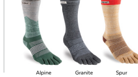
Alpine Granite Spur