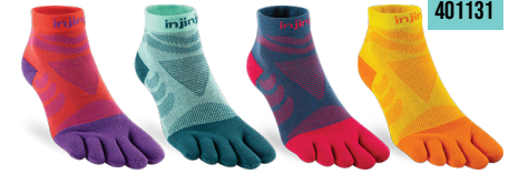
Razzmatazz Glacier Berry Sunflower