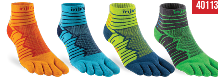
Desert Orange Pacific Blue Moss Emerald