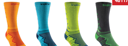
Desert Orange Pacific Blue Moss Emerald