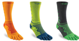
New Desert Orange New Moss New Emerald