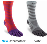
New Razzmatazz Slate