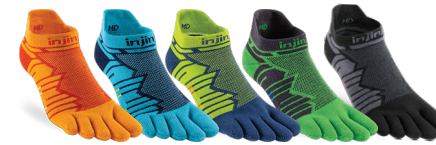
Desert Orange Pacific Blue Moss Emerald Onyx

STYLE: 401110 CUSHION: Midweight w/Padded Toes HEIGHT: No-Show SIZES: S, M, L, XL (Onyx, Pacific Blue) FIBER CONTENT: 64% Nylon 33% COOLMAX® EcoMade 3% Lycra®