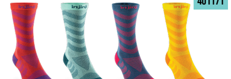
Razzmatazz Glacier Berry Sunflower