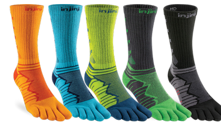
Desert Orange Pacific Blue Moss Emerald Obsidian

STYLE: 401170 CUSHION: Midweight w/Padded Toes HEIGHT: Crew SIZES: S, M, L, XL (Obsidian, Pacific Blue) FIBER CONTENT: 67% Nylon 28% COOLMAX® EcoMade 5% Lycra®