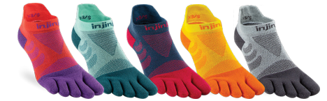
Razzmatazz Glacier Berry Sunflower Slate

STYLE: 401111 CUSHION: Midweight w/Padded Toes HEIGHT: No-Show SIZES: XS/SM, MD/LG FIBER CONTENT: 64% Nylon 33% COOLMAX® EcoMade 3% Lycra®