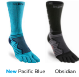
New Pacific Blue Obsidian