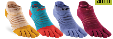
Golden Spice Sherbert Bluebell Beetroot