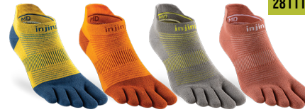
Royal Yellow Campfire Neon Silver Rust