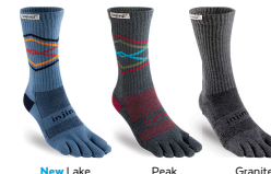
New Lake Peak Granite