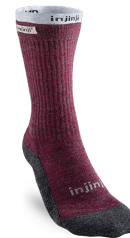
Maroon + Gray