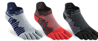
Cobalt Lava Onyx

STYLE: 401110 CUSHION: Midweight w/Padded Toes HEIGHT: No-Show SIZES: S, M, L, XL (Onyx) FIBER CONTENT: 33% COOLMAX® EcoMade 64% Nylon 3% Lycra®