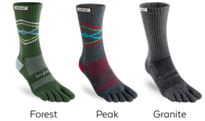
Forest Peak Granite

STYLE: 213170 CUSHION: Padded Cushioning HEIGHT: Crew SIZES: S, M, L, XL (Granite, Lake) FIBER CONTENT: 39% COOLMAX® EcoMade 58% Nylon 3% Lycra®