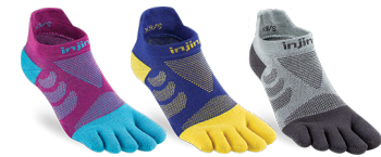
Jam Empire Slate

STYLE: 401111 CUSHION: Midweight w/Padded Toes HEIGHT: No-Show SIZES: XS/SM, MD/LG FIBER CONTENT: 33% COOLMAX® EcoMade 64% Nylon 3% Lycra®