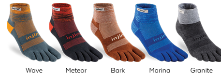
Wave Meteor Bark Marina Granite

STYLE: 213130 CUSHION: Padded Cushioning HEIGHT: Mini-Crew SIZES: S, M, L, XL (Granite, Marina, Moonlit) FIBER CONTENT: 39% COOLMAX® EcoMade 58% Nylon 3% Lycra®