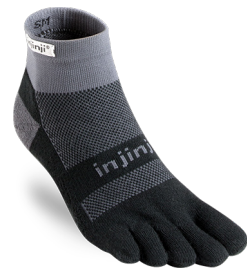
Black / Gray

STYLE: 203230 CUSHION: Padded Cushioning