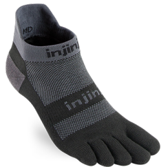
Black / Gray

STYLE: 203110 CUSHION: Padded Cushioning