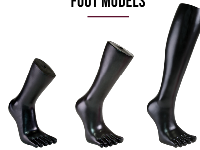
Quarter Crew Over the Calf