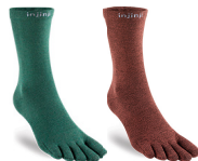
New Agave New Rustic