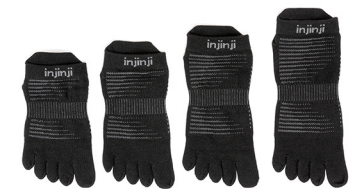
S M L XL