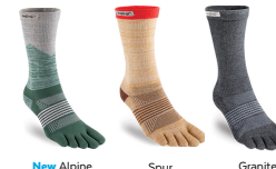
New Alpine Spur Granite