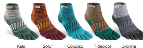
Kelp Solar Calypso Tidepool Granite

STYLE: 213131 CUSHION: Padded Cushioning HEIGHT: Mini-Crew SIZES: XS/SM, MD/LG FIBER CONTENT: 39% COOLMAX® EcoMade 58% Nylon 3% Lycra®