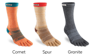
Comet Spur Granite

STYLE: 213171 CUSHION: Padded Cushioning HEIGHT: Crew SIZES: XS/SM, MD/LG FIBER CONTENT: 39% COOLMAX® EcoMade 58% Nylon 3% Lycra®