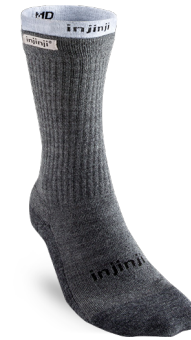
Charcoal + Gray